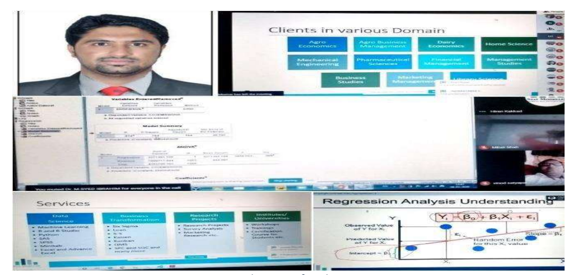
Glimpses of Webinar

The webinar was started with the welcome speech and introduction of the expert. First the expert gave the introduction about the Regression and how to do it using SPSS. He stated the application of SPSS in different domain. He also introduced the SPSS software and regression was nicely explained by him relating it with real life examples.